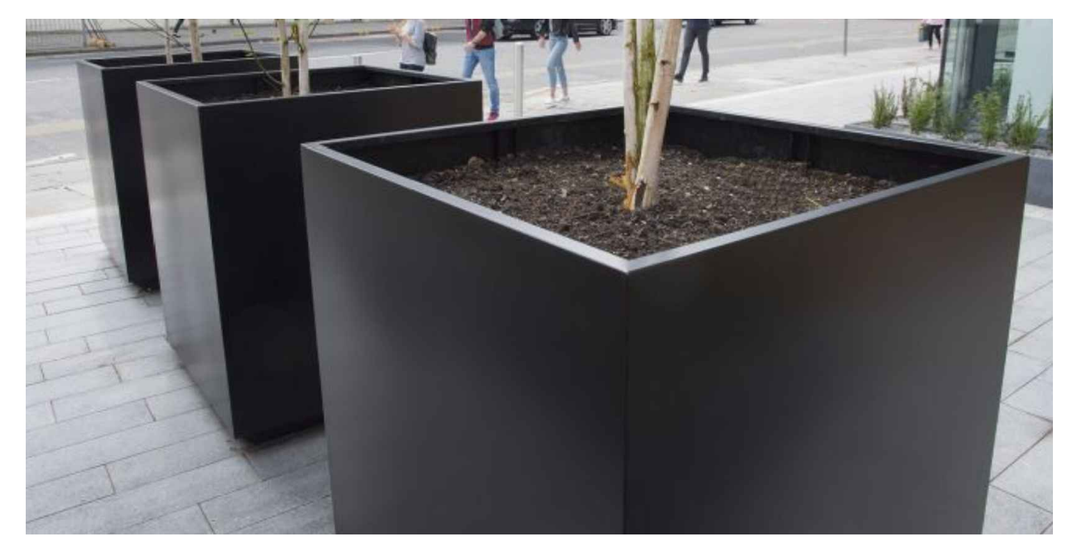
BLACK COLOUR METAL STREET PLANTERS