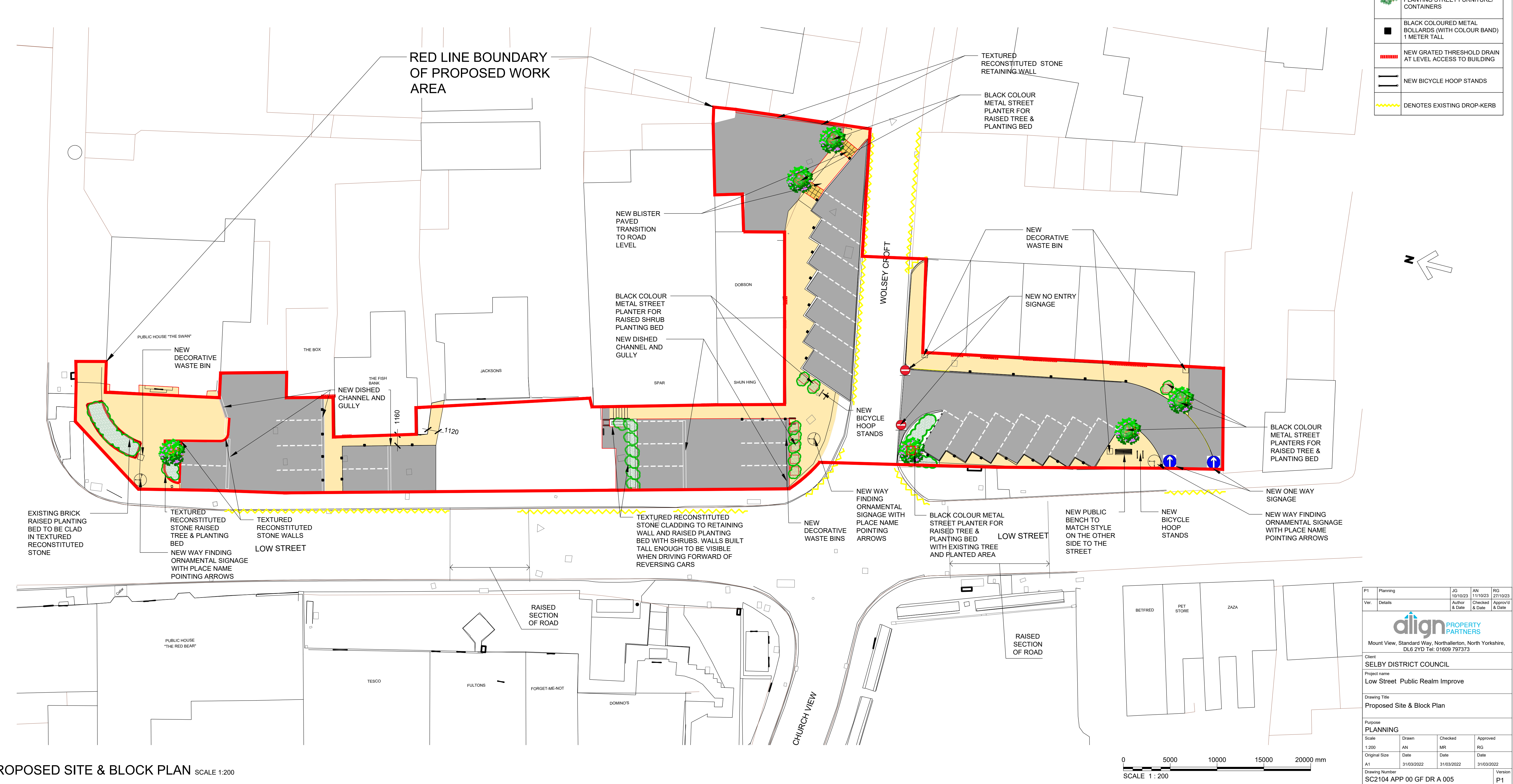
GRANITE AGGRIGATE PAVING AND TEXTURED KERBS TYPE B (PEDESTRIAN AREAS)